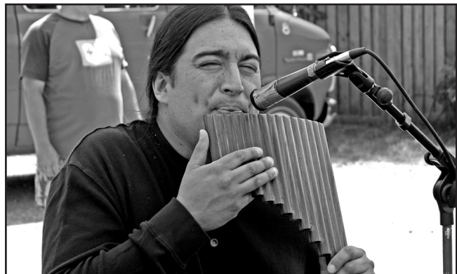
Musicians of all sorts filled the streets with enchanting sounds.