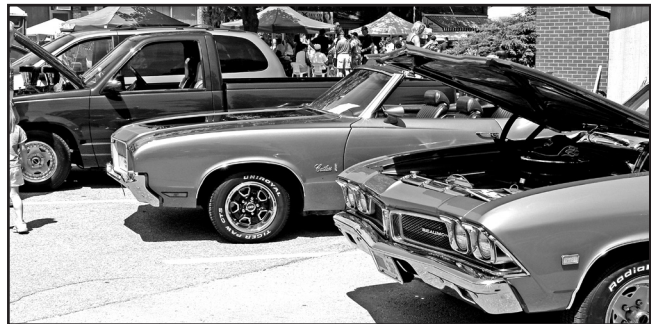
Muscle cars were a favourite.