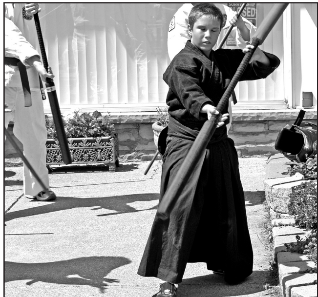
Classic Karate demonstrated the ancient art.