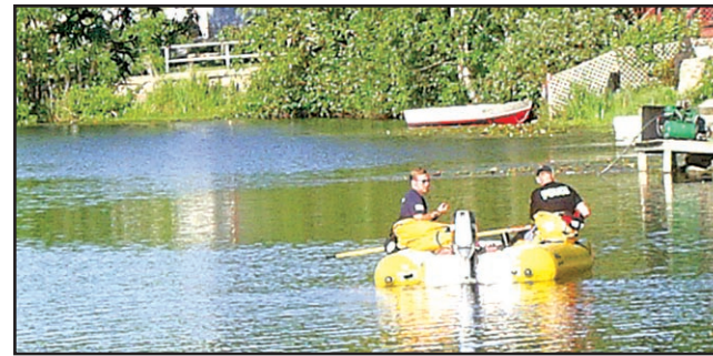
Halton Police investigate drowning