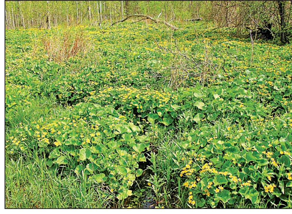
Marsh Marigolds turn lowland into a riot of colour