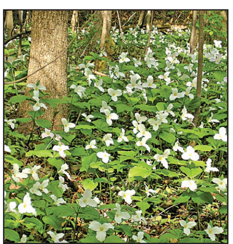
Ontario's emblem - the trillum carpets forest glades everywhere