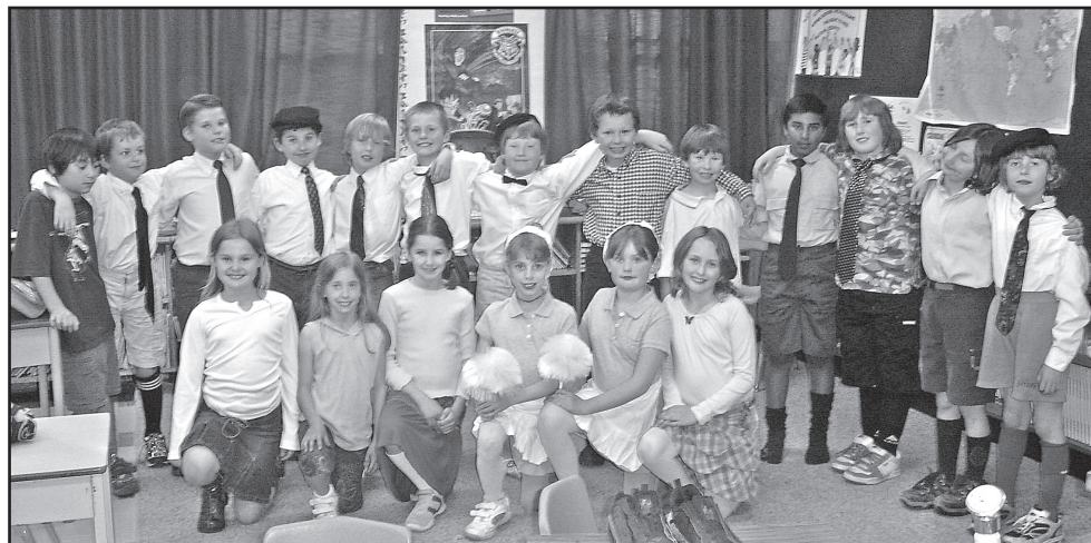
ENGLISH TREATS: This class of Grade Three French Immersion students performed the tongue twisting Supercalafragalisticexpealidocious during a spring show featuring Disney musicals at Robert Little School last Thursday.

1: Reconstruction of Main Street in Georgetown from Church Street to Guelph Street – $800,000