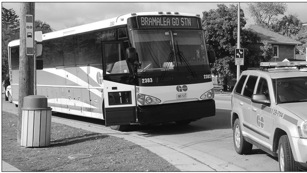
A 68-year-old Georgetown woman was taken to Hamilton General Hospital Tuesday morning after being pinned between the wheel and the curb.

At press time, Halton Police were still investigating the incident.