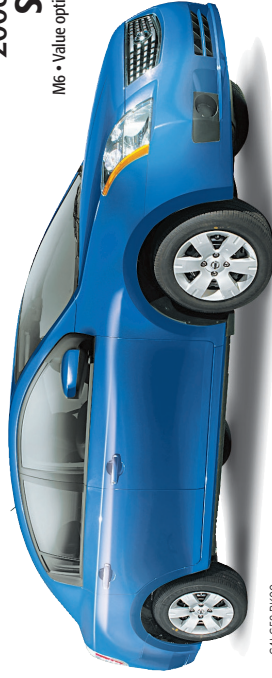
2008 NISSAN Sentra 2.0 M6 - Value option package included