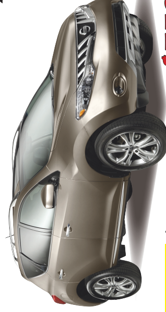
2009 NISSAN Murano AWD • All new re-design