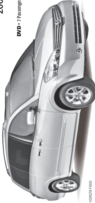
2008 NISSAN Quest S DVD • 7 Passenger • Dual sliding doors • Power group