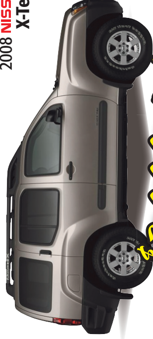
2008 NISSAN X-Terra