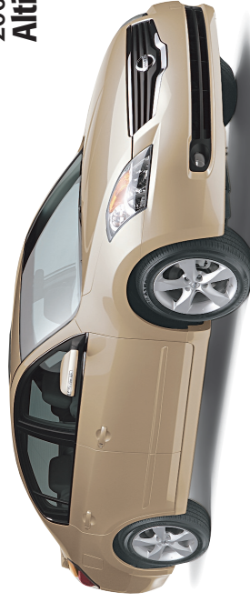
2009 NISSAN Altima Sedan 2.5 S • Automatic • Very well equipped