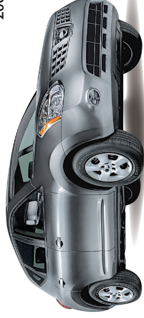
2009 NISSAN Rogue S • Fuel sipping CUV