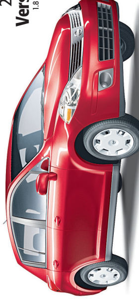
2009 NISSAN Versa Hatchback 1.8L Engine • Front & Rear Disk Brakes

PAYMENTS SHOWN ARE BASED ON ONLY $3,398 DOWN.