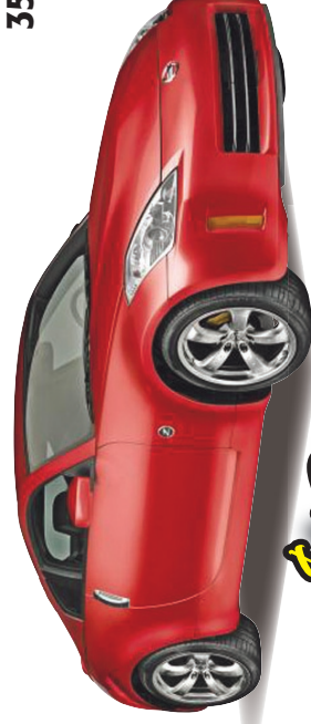
2008 NISSAN 350 Z