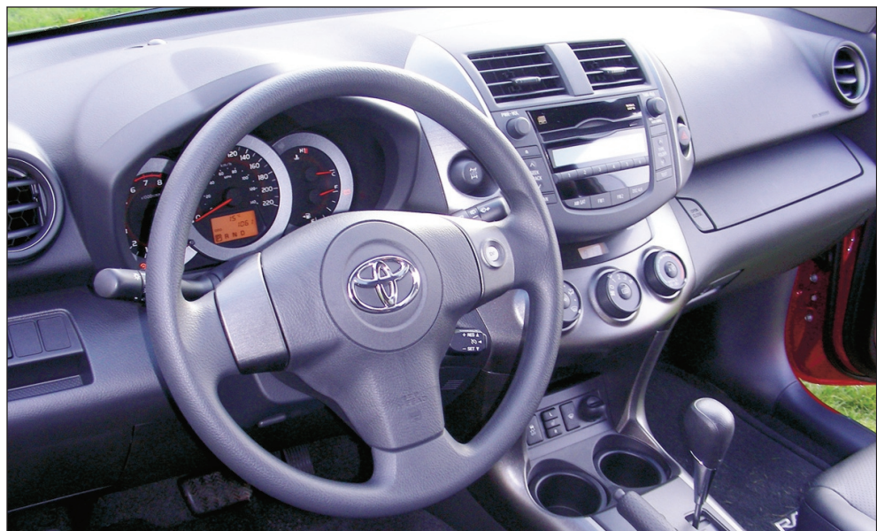
The interior on the 2009 RAV4 is available in three different colours.