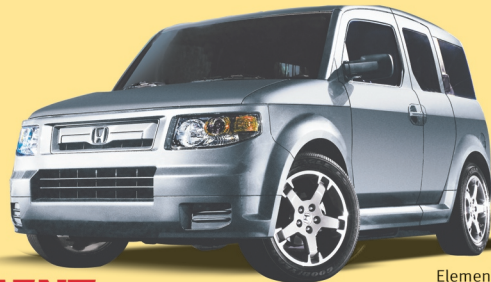
Element SC model YH1798E