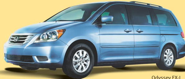
Odyssey EX-L model RL3868J

From the Government of Canada's ecoAUTO Rebate Program Q