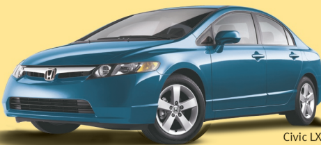
Civic LX model FA1558EX