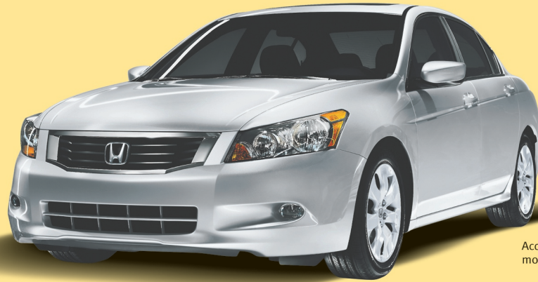
Accord EX-L V6 NAVI model CP3688KN

SIX '08 DEMOS TO CHOOSE FROM • Accord • CRV • Civic