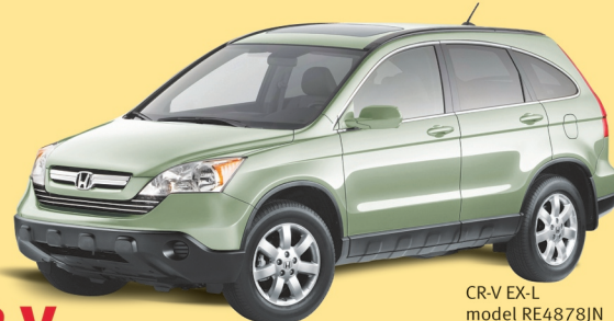
CR-V EX-L model RE4878JN