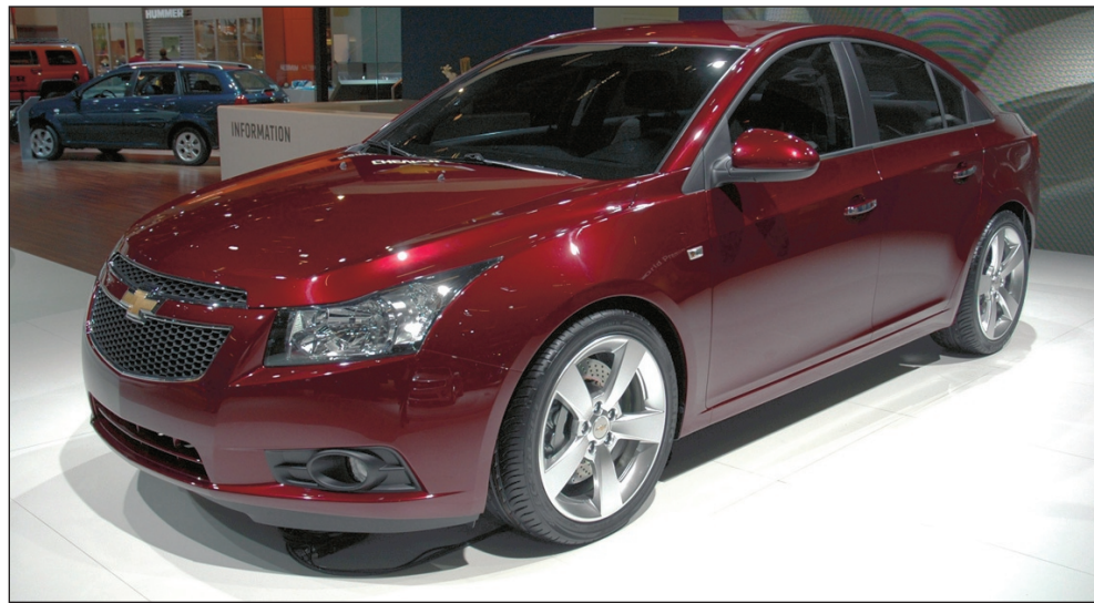
The Chevrolet Cruze will help owners downsize.

905-877-8731 email: tservice@on.aibn.com