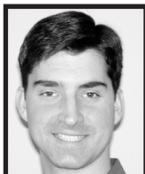
By Cory Soal R.H.A.D.

To register please contact 1-800-387-7127 or 905-691-0367 ext. 2319.