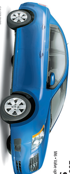
2008 NISSAN Sentra 2.0 M6 • Value option package included

CLASS BK00 Clearout Priced $16,889* or Lease 60 mths $155 @ 1.9%