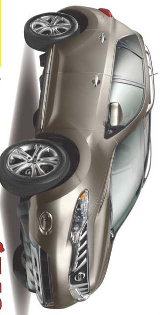
2009 NISSAN Murano AWD • All new re-design

V6R619 Clearout Priced $22,998* or Lease 48 mths $248 @ 4.9%