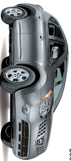
2009 NISSAN Rogue S • Fuel Sipping SUV

B5L G59 Clearout Priced $12,998* or Lease 48 mths $128 @ 4.9%