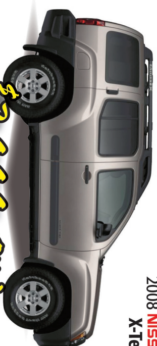
2008 NISSAN X-Terra

CLASS BK00 Clearout Priced $21,998* or Lease 60 mths $199 @ 1.9%