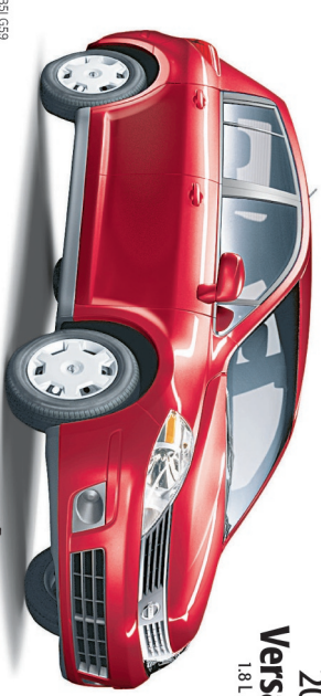
2009 NISSAN Versa Hatchback 1.8 L Engine • Front & Rear Disk Brakes

B5L G59 Clearout Priced $12,998* or Lease 48 mths $128 @ 4.9%