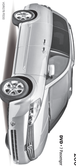
2008 NISSAN Quest S DVD • 7 Passenger • Dual sliding doors • Power Group

CLASS BK00 Clearout Priced $16,889* or Lease 60 mths $155 @ 1.9%