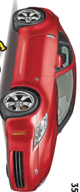
2008 NISSAN 350 Z