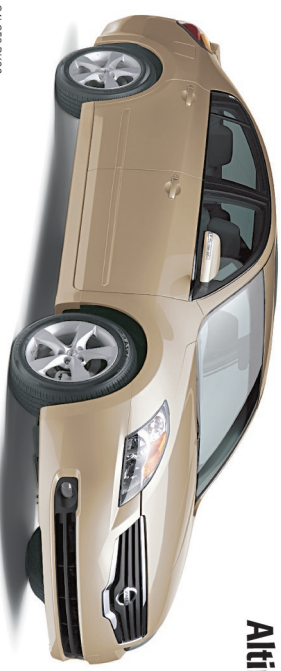
2008 NISSAN Altima Sedan 2.5 S • Automatic • Very well equipped

V6G78 FE00 Clearout Priced $27,769* or Lease 48 mths $299 @ 1.9%