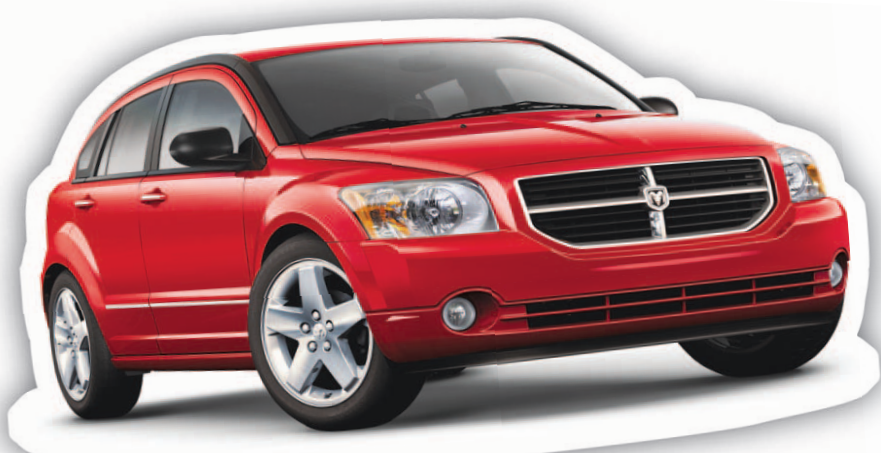
Caliber R/T model shown**