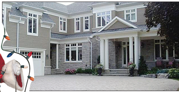
The tour this year will showcase seven fabulous homes that are situated in a range of areas of Halton Hills.

Two of the homes on this year's tour are 'two in one'. The former Georgetown 'Barber family' carriage house and barn is now two homes. The homes were built in the late 1880s and much of the original structure has been preserved.