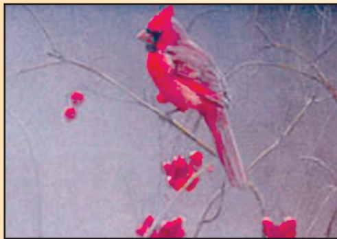
"Highbush Cranberries Cardinal"

FRI. NOV. 16 th 8:00-10:00 p.m. SAT. NOV. 17 th 7:30-9:00 p.m.