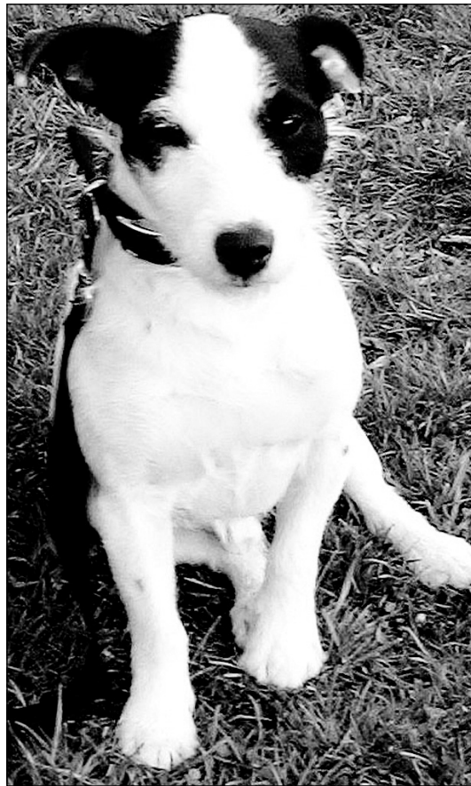
Chevy is a three-year-old Jack Russell.

This charming little fellow must go to an active home, and it would be a plus if the new family were familiar with the nature of the Jack Russell and realize that though petite in