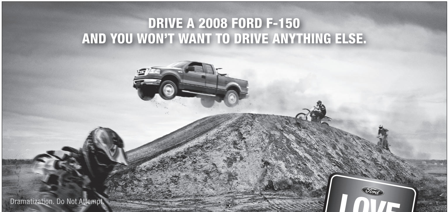
Dramatization. Do Not Attempt.

1 Halton Hills Dr., Halton Hills, ON L7G 5G2 Tel.: 905-873-2600 Fax: 905-873-2347