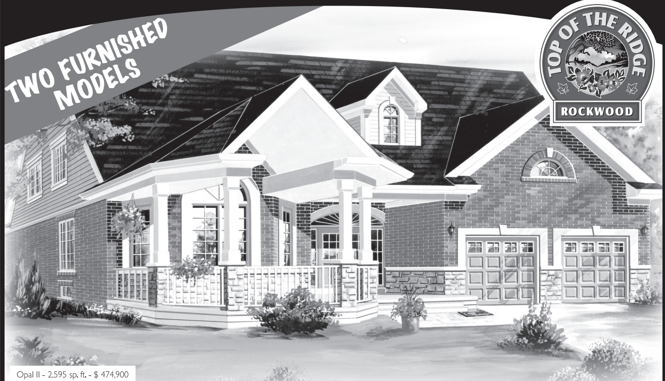
Opal II - 2,595 sq. ft. - $ 474,900

Situated on 51' lots, surrounded by scenic forests and protected by greenspace, On Top of the Ridge in Rockwood. Premium and Walkout Lots Available.