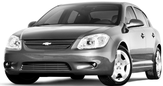
*Cobalt SS model shown.