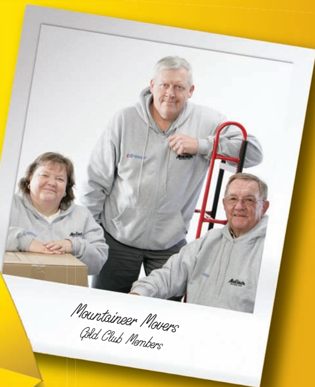
Mountaineer Movers Gold Club Members