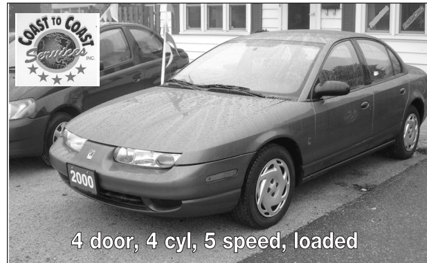
4 door, 4 cyl, 5 speed, loaded