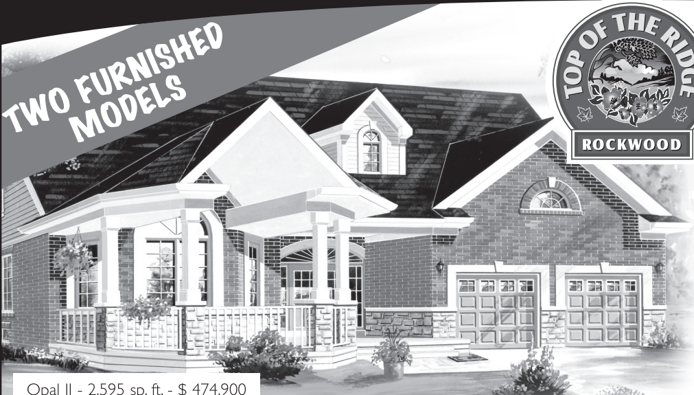
Opal II - 2,595 sq. ft. - $ 474,900

Situated on 51' lots, surrounded by scenic forests and protected by greenspace. On Top of the Ridge in Rockwood. Premium and Walkout Lots Available.