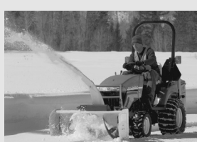
Advantage Series Tractors