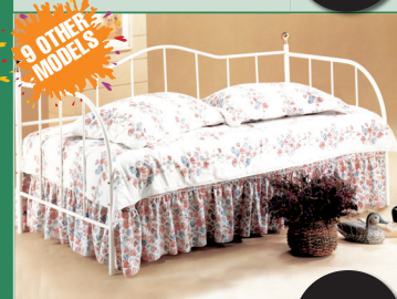
WATERFALL DAY BED