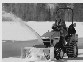
Advantage Series Tractors