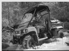
Gator 620i XUV 4x4

No Payments, No Interest for 12 months**