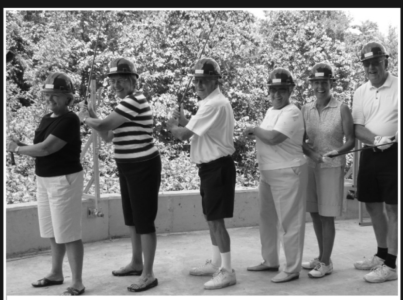
Gallery Golfers swing into action from the 2nd floor Terrace. Just 6 of the over 80 owners watching the construction of The Gallery at Bennett Village.

Swing into action - Reserve your suite COMING SOON • PREMIUM 60 PLUS LIVING!