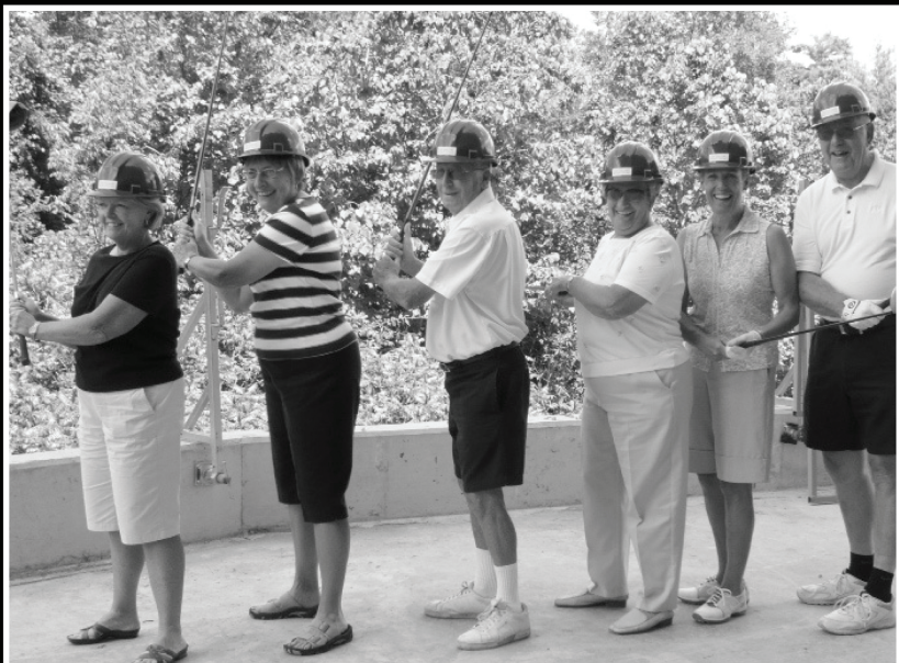
Gallery Golfers swing into action from the 2nd floor Terrace. Just 6 of the over 80 owners watching the construction of The Gallery at Bennett Village.

Hours: Monday - Friday 9-5; Saturday 11-4; Appointments available after hours upon request