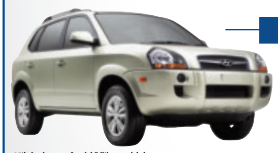
Limited model shown