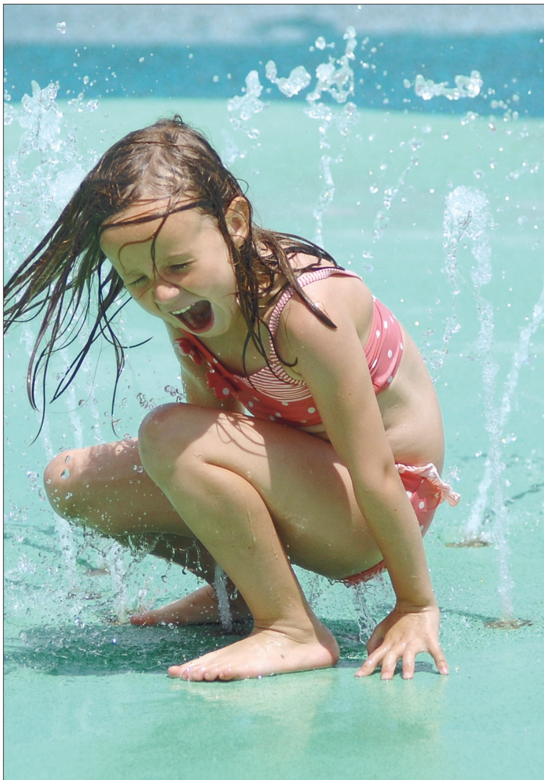
Cooling off at the splash pad

For breaking news go to: www.independentfreepress.com