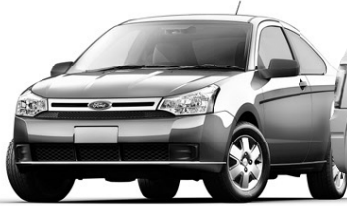
2008 FORD FOCUS SE WITH AIR CONDITIONING AND MP3 PLAYER

FUEL ECONOMY** HIGHWAY 5.7L/100km CITY 8.5L/100km (33 mpg)