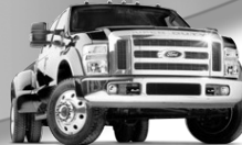
2008 Ford Super Duty F-450 Crew Cab Lariat 4x4

AND GET 0%† APR PURCHASE FINANCING UP TO 60 MONTHS on select 2008 Ford Vehicles.