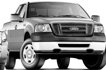
2008 FORD F-150 REGULAR CAB XL F-SERIES IS CANADA'S BEST SELLING LINE OF PICK UPS FOR 42 YEARS†

up to 36 months on most 2008 Ford Escape.