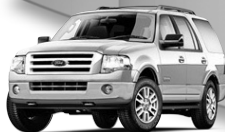
2008 Ford Eddie Bauer 4x4 Expedition

ON A GREAT SELECTION OF 2008 AND 2009 FORD VEHICLES.