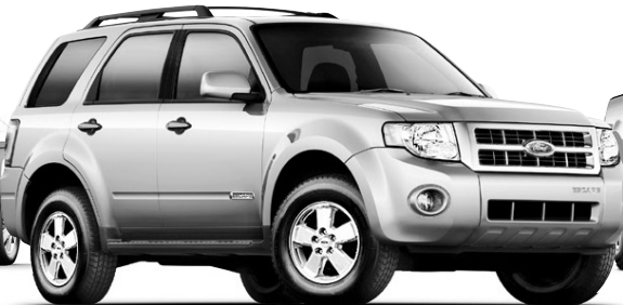
2008 FORD ESCAPE XLT CANADA'S BEST SELLING COMPACT SUV†

up to 36 months on all 2008 Focus SE and SES Models.