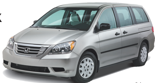
Odyssey DX model RL3818E