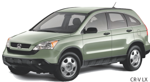
CR-V LX model RE3838E