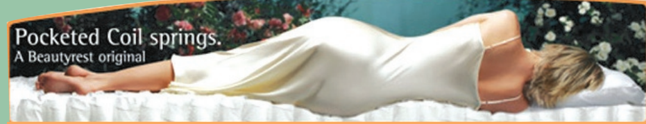
Pocketed Coil springs. A Beautyrest original