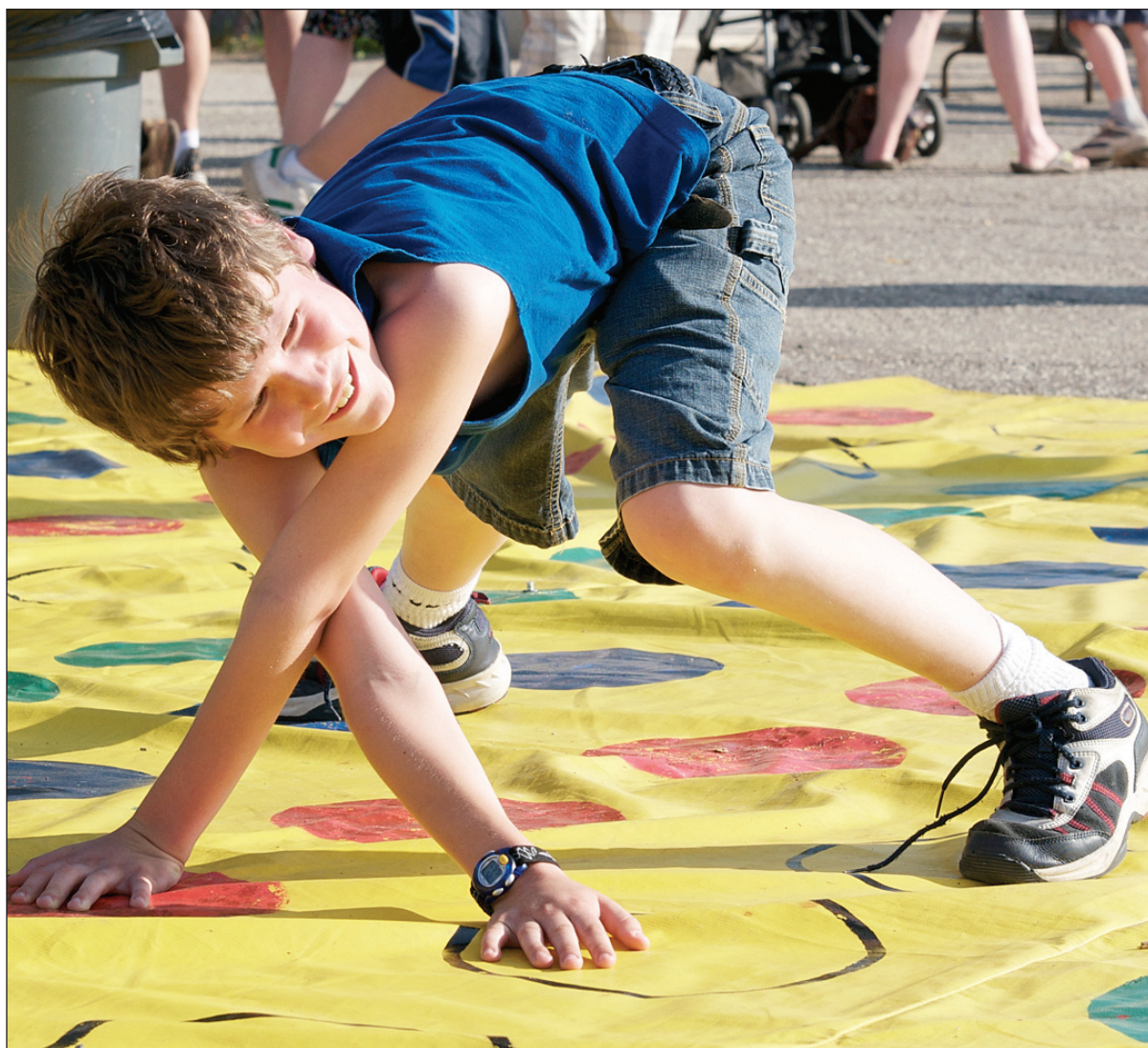
'X' marks the spot

For breaking news go to: www.independentfreepress.com