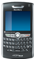
BlackBerry® 8830 World Edition smartphone

Get up to $100 off smartphones with GPS Nav 1 – the ultimate Father's Day gift.