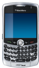
Next generation BlackBerry Curve™ 8330 smartphone

with $50 Smartphone bundle discount and a $45 voice and data plan on a 3-yr. contract 1 ($699.95 no contract)