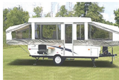
All Tent Trailers Must Go