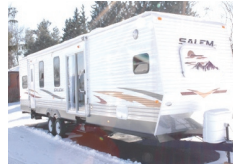
Salem Park Models

Located at 10 Lindsay Court, Georgetown one block south of Hwy. #7 off Trafalgar Rd. (13 km North of 401)