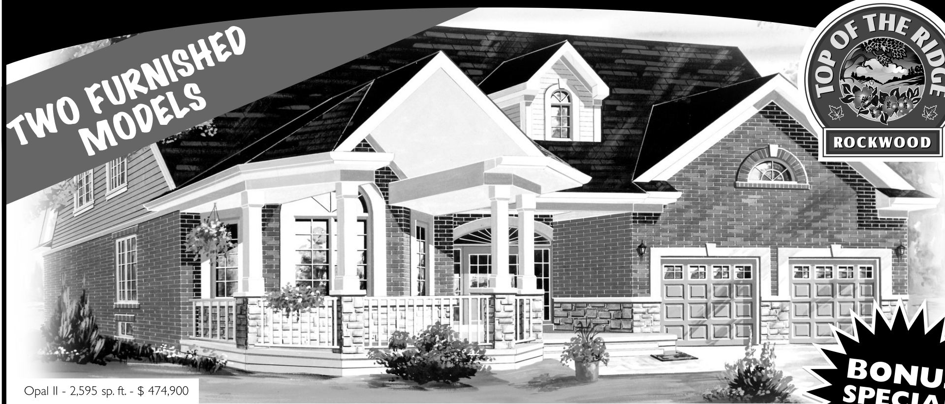
Opal II - 2,595 sp. ft. - $ 474,900

Situated on 51' lots, surrounded by scenic forests and protected by greenspace, On Top of the Ridge in Rockwood. Premium and Walkout Lots Available.