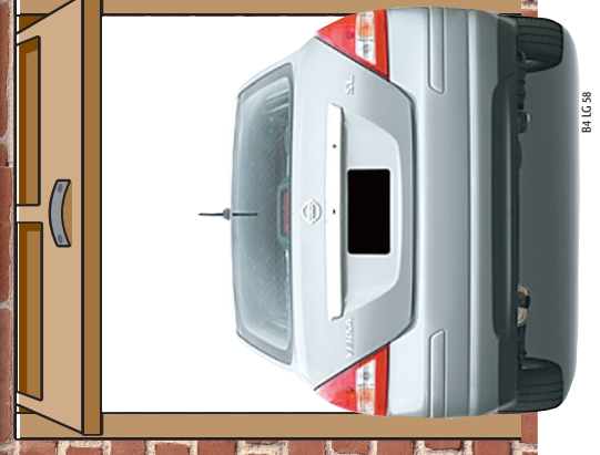
B4 LC 5E