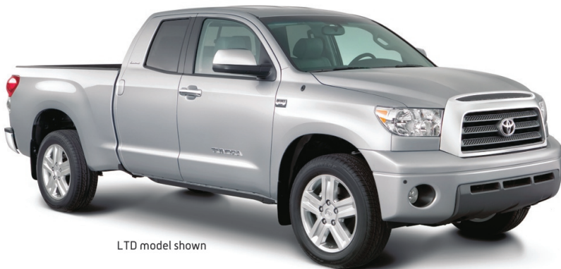
LTD model shown