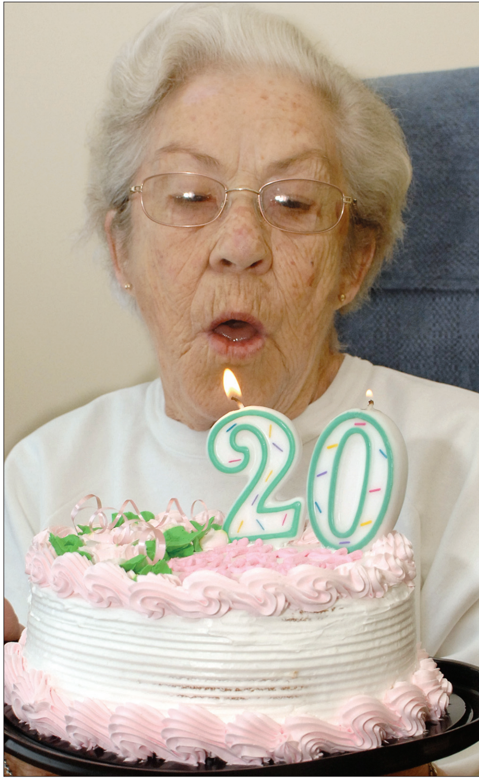
Birthday girl turns 20

For breaking news go to: www.independentfreepress.com