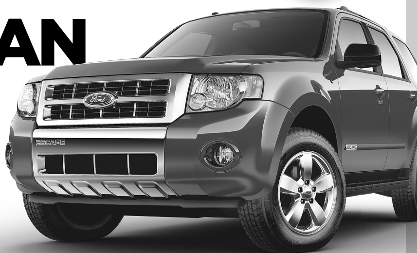
Escape Limited Shown with optional equipment. MSRP $33,094.**

FORD ESCAPE IS CANADA'S #1 SELLING COMPACT SUV.*