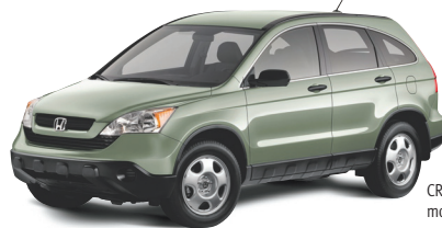
CR-V LX model RE3838E