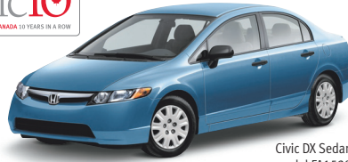
Civic DX Sedan model FA1528EX

LEASE DOWN PAYMENT $0 LEASE FOR $198 @ 1.5% LEASE APR