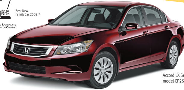
Accord LX Sedan model CP2538E