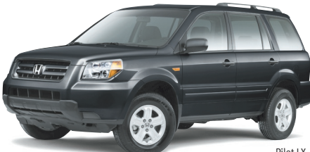
Pilot LX model YF2818EX