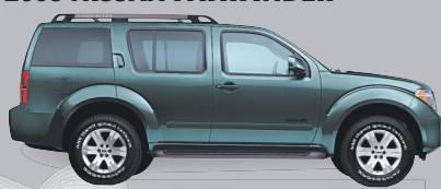
2008 NISSAN PATHFINDER