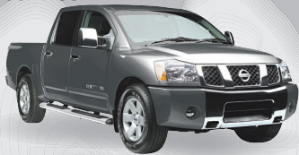
2008 NISSAN TITAN