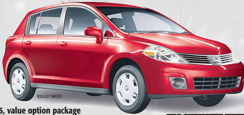
2008 VERSA HATCH 1.8S