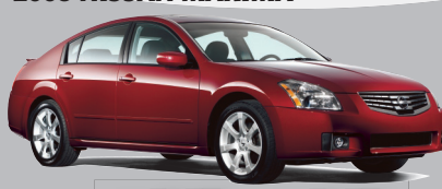
2008 NISSAN MAXIMA