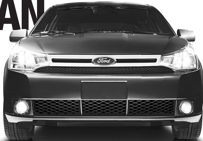
Focus SES shown with optional equipment. $19,149.

Includes EXCLUSIVE CANADIAN DELIVERY ALLOWANCE