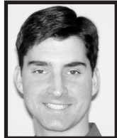
By Cory Soal R.H.A.D.

Product: HP DV9758CA. Please note on page 22 of the January 18th flyer, sku 10098184 HP DV9758CA has a 17" screen not a 14" screen. SKU:10098184