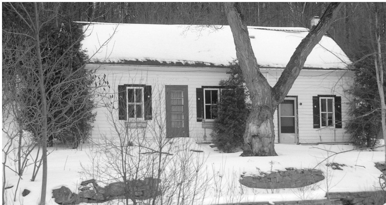
Halton Hills council has given family members associated with Beecham House, a mid-19th Century farmhouse located on 27 Sideroad, six months to find a way to salvage the homestead. Credit Valley Conservation wants to deconstruct the house saying it is a target for vandals and a safety hazard. Relatives of the home's previous owners contend the CVC let it fall into disrepair.