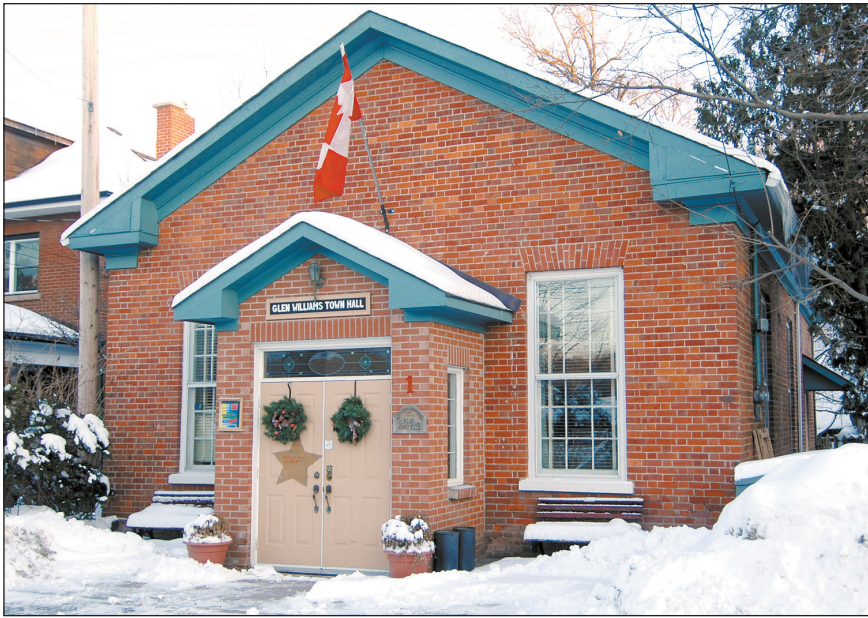
GLEN WILLIAMS TOWN HALL