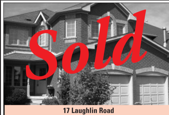
17 Laughlin Road