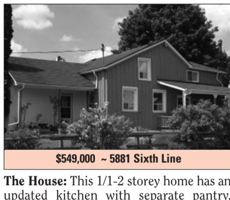
$549,000 ~ 5881 Sixth Line

Over 3000 sq. ft. of totally up-graded living space. Large open concept kitchen with counter space and cup-boards galore. Excellent location for commuters. 4 large bedrooms, 4 bathrooms, fully finished walkout basement with 2 bedrooms and a second kitchen. Call Mary*, Tony* or Emma* to view.