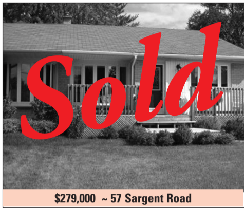
$279,000 ~ 57 Sargent Road