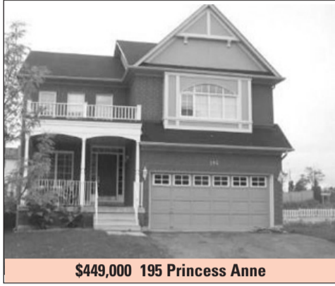
$449,000 195 Princess Anne

This home is a 10+, updated, spotless and ready to go. Bright spacious floor plan, 3 bedroom, 2 bathrooms, fully finished large basement with separate entrance and above grade windows. Good sized, well cared for lot. This one won't last, call Mary*, Tony* or Emma* to view.