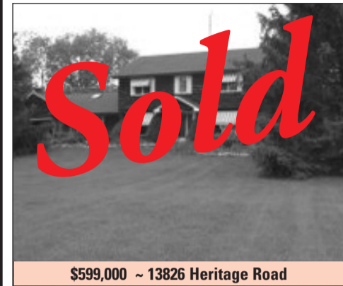
$599,000 ~ 13826 Heritage Road

The Land: 25 acres, over 12 are workable, property borders a newer subdivision. Access the Bruce Trail from your own back yard. Call Mary*, Tony* or Emma* to view.