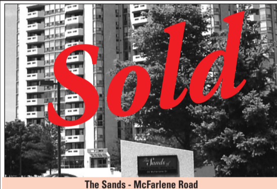
The Sands - McFarlane Road