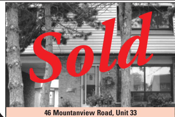
46 Mountainview Road, Unit 33

4.6 acres in Caledon Hills overlooking Terra Cotta. This magnificent property must be seen to be appreciated!