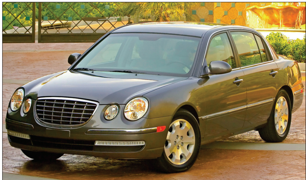
The 2007 Kia Amanti has been awarded a "Good" rating by Insurance Institute for Highway Safety in the U.S.

On the active safety equipment front, Amanti features a standard four-wheel disc antilock braking system (ABS) with electronic brake distribution (EBD), which apportions braking force front and rear according to the vehicle's load distribution. Electronic stability control, traction control and brake assist also are available, and help control the vehicle in the event of a severe stop, applying the brakes to individual wheels while reducing engine power to help bring the vehicle safely back on its intended course.