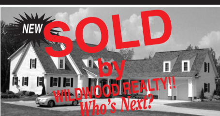
STUNNING HOME ON 10 ACRES!!