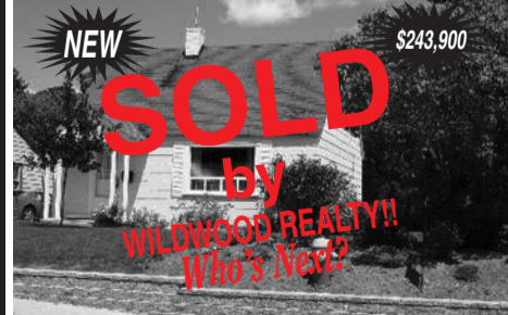
ONE FOR THE MONEY!