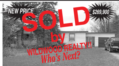
COUNTRY LIVING 1 ACRE - BACKS ONTO HORSE FARM!