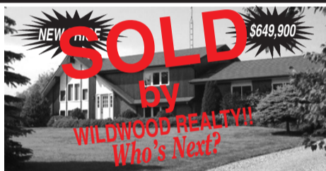
35 ACRES BETWEEN GEORGETOWN AND MILTON

CHECK OUT OUR LISTINGS ON THE WEB . . . WILDWOODREALTY.CA