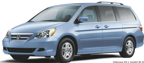
Odyssey EX-L model RL3867J $40,000 MSRP