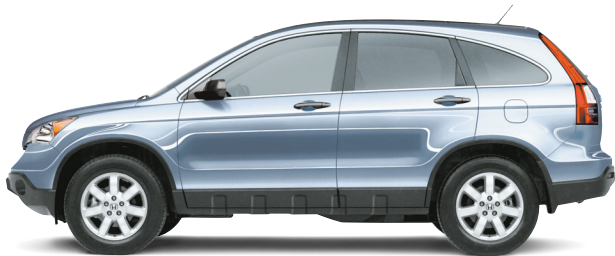
CR-V EX-L model RE4B77JN $34,600 MSRP