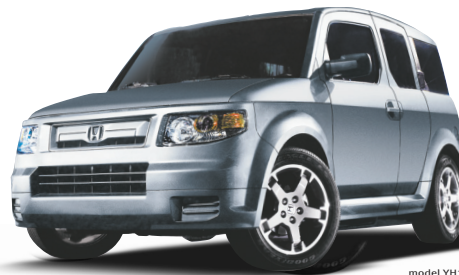
Element SC model YH1797E $29,900 MSRP