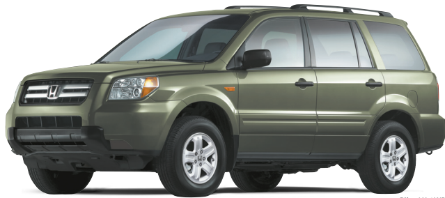
Pilot LX 2WD model YF2B17EX