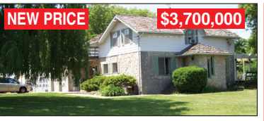
NEW PRICE $3,700,000

Located on Highway #7 (Guelph Street) in Georgetown. This space is waiting for your business! Features high ceilings, wsrms, highway 7 signage and exposure. Popular indoor mall location. Lots of parking. A great value in this excellent, well maintained building in town! Call The Krause Family for more information.