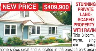
NEW PRICE $409,900