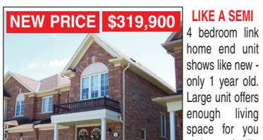
NEW PRICE $319,900

This home shows great, located on a quiet street and features 3 spacious bdrms, 3 wsrms, single car garage, hrdwd flrs in living/dining rooms, ceramic flooring in all bathrooms, foyer and kitchen. Mbr has 4 pc ensuite featuring sep shower and soaker tub, w/i closet, large eat-in kitchen has private yard with no homes behind! This one has everything you'll need, a great family home in an excellent area of town. Call The Krause Family for more information or your personal viewing.