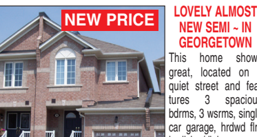
NEW PRICE $299,900

Come home every night to "Your Own Piece of Paradise". This approx 1 acre property backs onto the Credit River, has lots of privacy, mature trees, pond with fountain etc. And features lovely 3450 sq ft bungalow (including bsmt), with 4+1 bdrms, 2 wsrms, large eat-in kit., sunroom with 2 skylights, hrdwd flrs, 2 FPs, w/o bsmt to patio & yard, large party sized deck overlooks river and property, fin. bsmt offers spacious family rm with FP and w/o to patio & yard, sep heated workshop and 5th bdrm with 4 pc ensuite wsrms. This home and property is nestled on a quiet dead end street in the prestige Glen Williams area. Call The Krause Family .