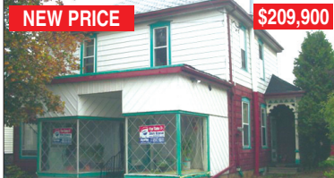
NEW PRICE $209,900