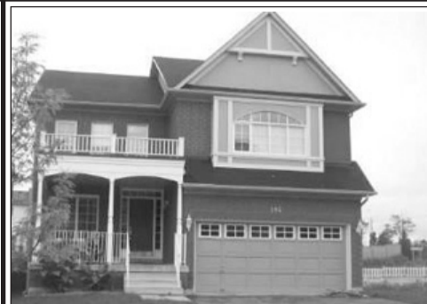
$449,000 195 Princess Anne