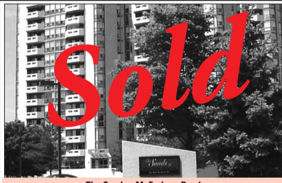
The Sands - McFarlane Road