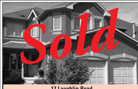
17 Laughlin Road