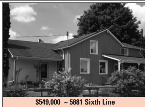
$549,000 ~ 5881 Sixth Line

4.6 acres in Caledon Hills overlooking Terra Cotta. This magnificent property must be seen to be appreciated!