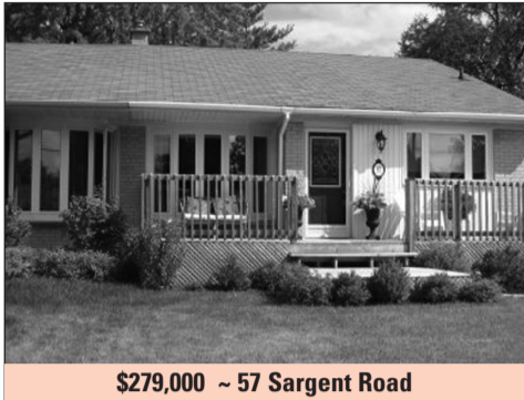
$279,000 ~ 57 Sargent Road