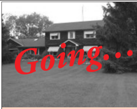
$599,000 ~ 13826 Heritage Road

This home is a 10+, updated, spotless and ready to go. Bright spacious floor plan, 3 bedroom, 2 bathrooms, fully finished large basement with separate entrance and above grade windows. Good sized, well cared for lot. This one won't last, call Mary*, Tony* or Emma* to view.