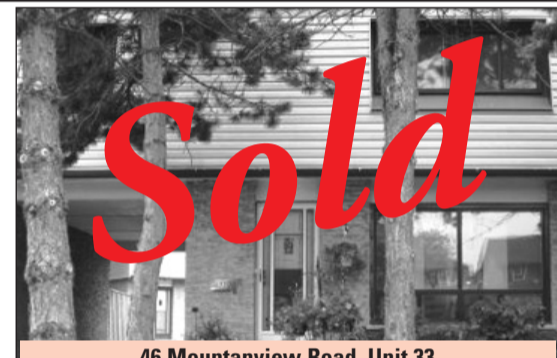
46 Mountainview Road, Unit 33

Over 3000 sq. ft. of totally up-graded living space. Large open concept kitchen with counter space and cup-boards galore. Excellent location for commuters. 4 large bedrooms, 4 bathrooms, fully finished walkout basement with 2 bedrooms and a second kitchen. Call Mary*, Tony* or Emma* to view.